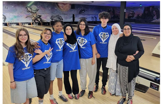
**Photos attached. No problem to publish them, we have people's consents.